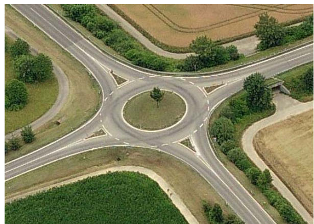
The Roundabout on the right replaced an intersection with many severe accidents.