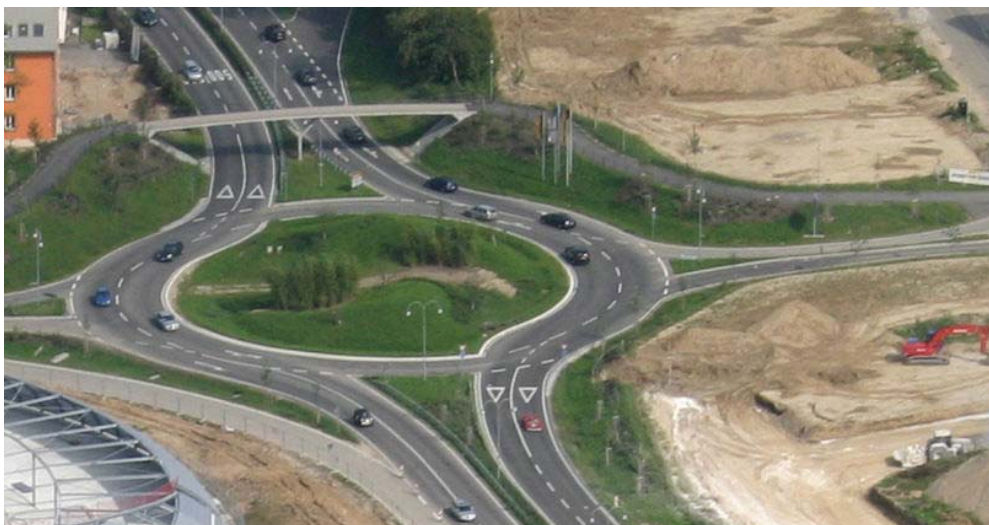
Figure 12 : Turbo-roundabout in Baden-Baden

It can be expected that new experiments will come up in Germany in the future also with larger roundabouts, e.g. with spiral markings. One idea for such a larger roundabout is the type of a so-called Turbo-Roundabout. The first Turbo-Roundabout has been built in 2006 in the town of Baden-Baden [13] (see Figure 12). Here, vis-a-vis from the mayor entries a second lane is added on the inner side of the ring, whereas at exits with a significant exiting flow the vehicles on the outside lane are forced to continue their way into the exit. This type could be of special benefit at locations where the through traffic has larger volumes. This type is mainly in use in the Netherlands where it has been invented by Bertus Fortuijn. There however, curbs are used to separate the lanes within the circular roadway, a solution which is not accepted in Germany due to safety and winter service considerations.