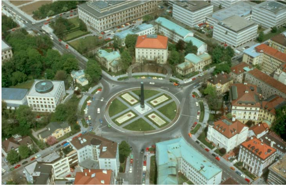
Figure 1 : Large traditional roundabout in Munich