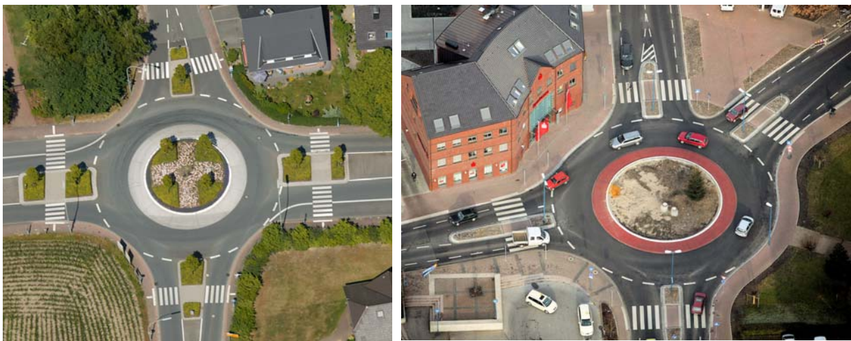
Figure 5 : Compact single-lane urban roundabout (left side: prototype-like design)

For pedestrians and cars the compact roundabout seems to be the safest type among all types of intersections [7]. For pedestrians the walkways crossing the entries and exits should be built in a distance of 4 to 5 m away from the margin of the circle. Zebra crossings (which impose an absolute right of way for pedestrians in Germany) should be installed in urban areas according to the guidelines [2] (see Figure 5). This rule is mainly due to the fact that zebra crossings are demanded by the public. But in most cases they are not of a real advantage to the pedestrians. Also without zebra crossings the pedestrians have no delays neither at entries nor at exits of a roundabout. Also accidents with pedestrians are quite seldom at single-lane roundabouts.