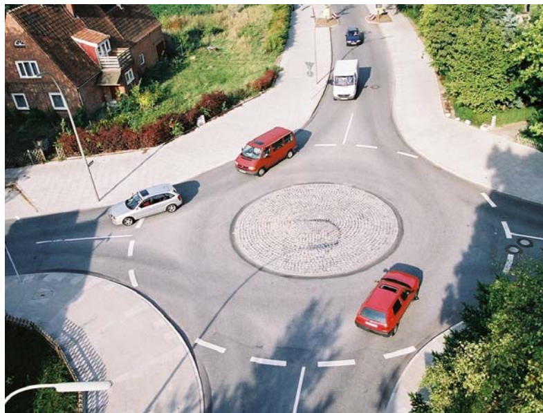
Figure 4 : Mini Roundabout in Hamburg

As a result of the investigations the following rules are recommended for application [4] and [2]: