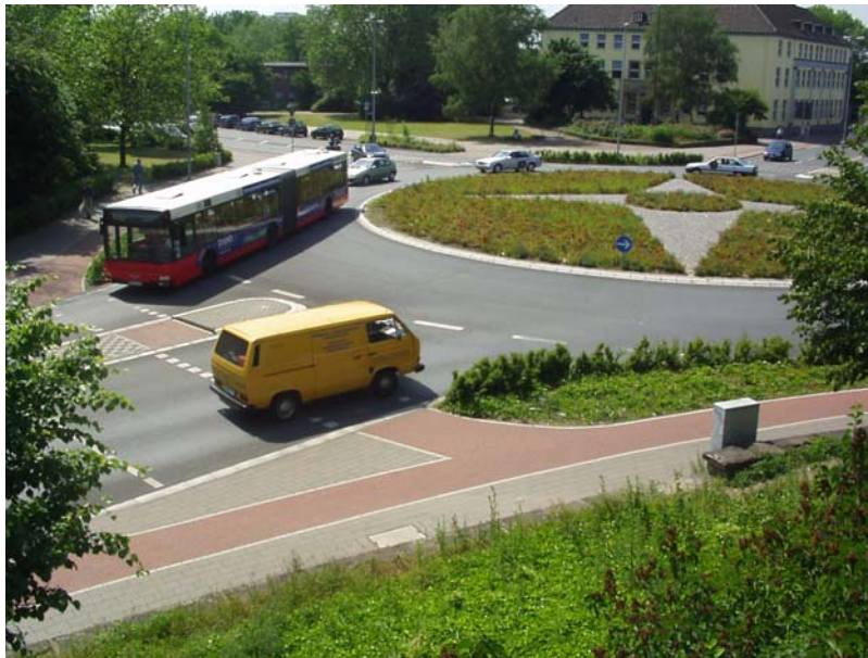
Figure 9 : Urban compact two-lane roundabout in Oberhausen

There was always a rather restrictive view in Germany on new large roundabouts in the style of Figure 1. The restrictions are based on bad accident experience. They are, however, demanded by the public. As a first approach towards larger roundabouts, a new intersection type has been created: The compact semi-two-lane circle. Ideas for this type were described in a preliminary document from 2001 [9] and consequently this new type was built by several municipalities and highway authorities. In succession an investigation on this new type has been performed on behalf of the federal DOT [11] which lead to the acceptance of this compact two-lane roundabout by the guideline from 2006 [2]. Thus, these roundabouts are now state-of-the-art solutions.