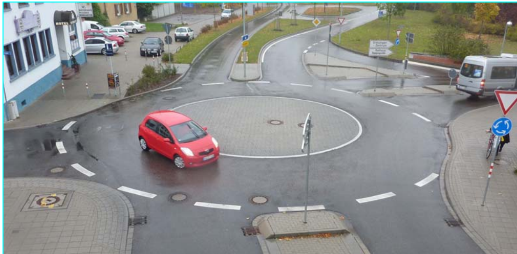
Figure 3 : Mini-Roundabout in Karlsruhe

Here it should again be emphasized that in Germany, as a tradition and according to official rules, both personal injury accidents as well as damage-only accidents are included in the police files and, thus, also in the described accident rates and accident cost rates.