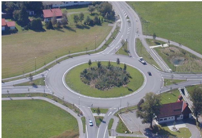
Figure 10 : Rural compact two-lane roundabout in Bad Aibling

The design of compact two-lane roundabouts is similar to the concept of single-lane roundabouts. The main difference is the width of the circle lane. It is wide enough for passenger cars to drive side by side, if required. However, the circle lane has no lane marking. Large trucks and busses are forced to use the whole width of the circulatory roadway making their way through the intersection. The fundamental characteristics of these compact two-lane roundabouts are: