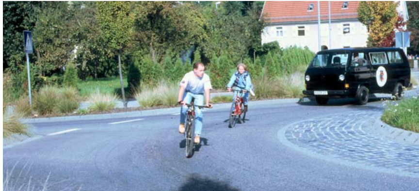
Figure 6 : Operation of bicycle traffic on the circular roadway for traffic volumes below an ADT of 15,000 veh/day. Due to similar desired speeds (in a range between 15 and 25 km/h) of cars and cyclists no overtaking is required. Cyclists can indicate their intended direction of driving clearly by their trajectory through the intersection.

vehicles at the crossing points to assign more responsibility for their own safety to the cyclists themselves (see Figure 7, right side).