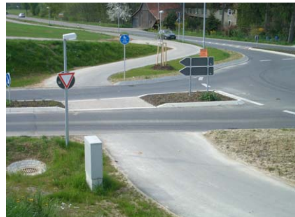
Figure 7 : Bicycle track combined with a zebra-crossing (urban, left) and combined with walkway (rural, right). In the urban context cyclists have the right of way whereas at rural intersections cyclists have to yield to motorized traffic.