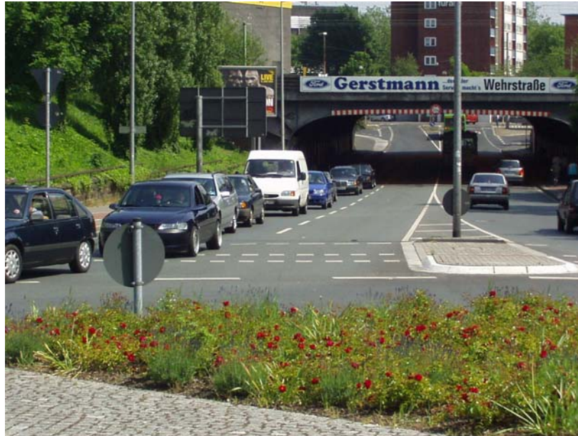
Figure 11 : Typical driver behavior at a compact two-lane roundabout: The left entry lane is not accepted. Drivers are afraid of conflicts when leaving the circle from the inner lane.

Especially 2-lane exits are completely banned. Also three-lane (or larger) unsignalized roundabouts are not under consideration in Germany. This is highly correlated to the kind of traffic rules in Germany. It should be noted that in Germany, like in other countries on the European continent there is no traffic rule for the interaction between vehicles on the circular lanes.