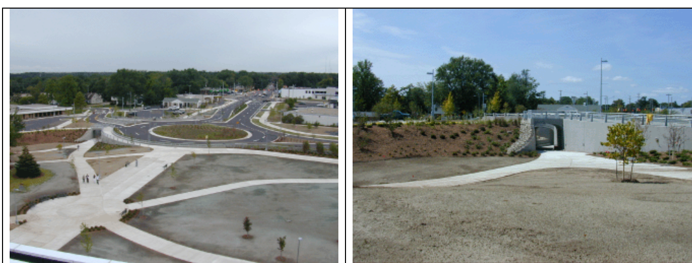
WMU Rbt Pedestrian Underpass to Left

The Department of Blindness and Low Vision Studies at Western Michigan University offers graduate students preparation for becoming orientation and mobility specialists, rehabilitation teachers, teachers of visually impaired children, and rehabilitation counselors. A roundabout was constructed in Summer 2004 at the western entry into campus that includes a pedestrian underpass that routes pedestrians under the roundabout. Unfortunately, not every City or development has the funds to provide this separation between vehicles and pedestrians.