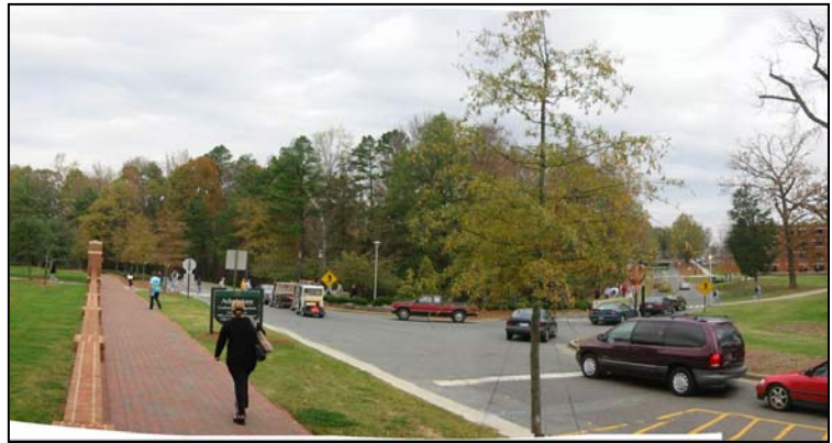
The University of North Carolina is currently constructing a roundabout on their campus ring road that includes a pedestrian crosswalk signals. Although there are three mid-block crosswalks near the roundabout only one was found to warrant installation of a pedestrian crossing signal. The intersection is shown at left.

There are approximately 600 pedestrians crossing this crosswalk at UNC Charlotte during peak hours. The signal is pushbutton operated Red-Yellow-Green with APS signals for blind pedestrians.