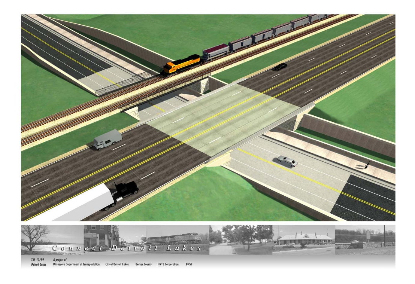
2. Detroit Lakes - TH-10 Highway - City of Detroit Lakes, MN and Minnesota DOT - still image of proposed grade separation of TH-10 and BNSF railroad over Roosevelt Avenue.