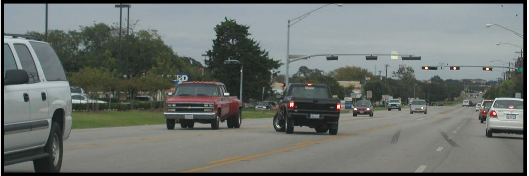
Texas Ave – south end