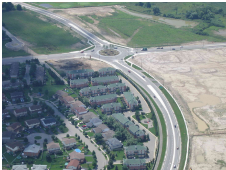
Figure 3.2 Roundabout at Ira Needles Boulevard and Erb Street

The first roundabout to be constructed in the Region, and the first multi-lane roundabout on an arterial road in Ontario, is at Ira Needles Boulevard and Erb Street. It has an inscribed circle diameter (ICD) of 55 metres (180 feet), with flared two-lane entries on Ira Needles Boulevard and on west leg of Erb Street and a full two-lane entry on the east leg of Erb Street. See Figure 3.2.